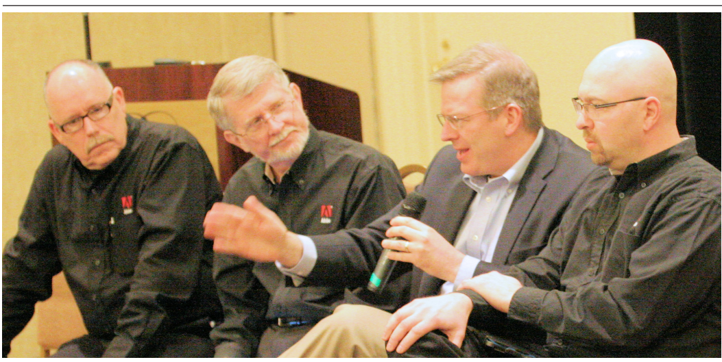
Several members of the user assistance trends panel at Adobe's Sunday morning session.

Dave's session was, as usual, filled with lots of code.